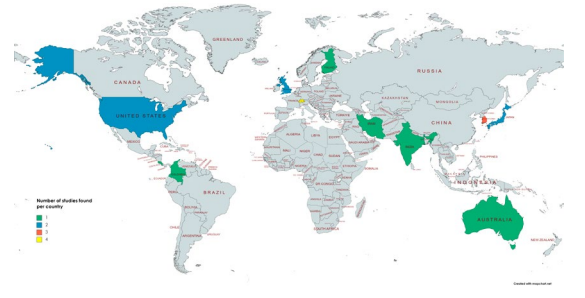
FIGURE 3. Map of the countries where the studies took place.

The presented studies took place in 11 countries (Figure 3), although, in many cases, researchers of the same study came from different Universities, regions and even from different countries. The place where more studies were conducted was Zürich, Switzerland, with a total of 4.